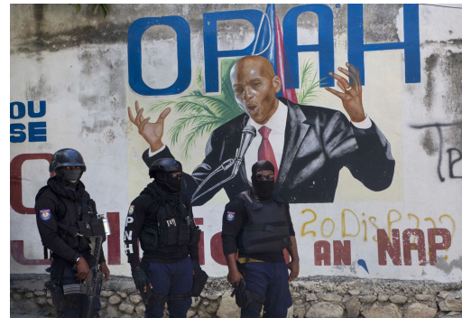
2021 Haitian Presidential Assassination