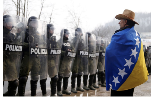
2021 Tensions in Bosnia and Herzegovina