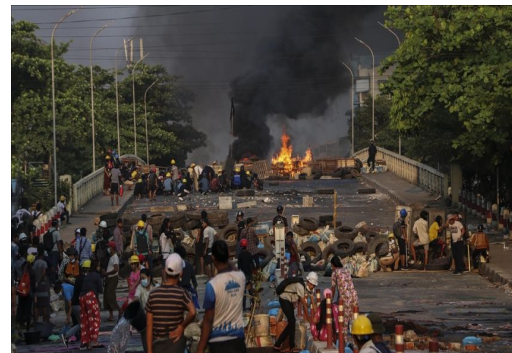
2021 Myanmar Coup